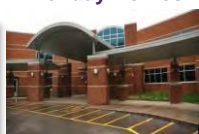
Hospitals & Schools

Libraries of function specific, rapid deployment communities can be created quickly as sales diversity grows