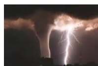
Disaster Relief Homes