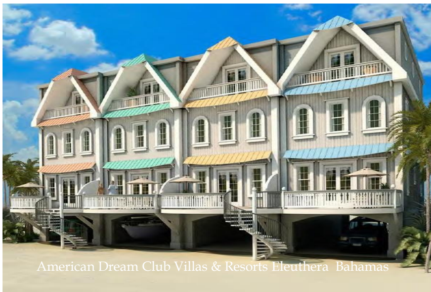
American Dream Club Villas & Resorts Eleuthera Bahamas

The American Dream system is patented. American Dream Co will continually file patents as part of its defensive arsenal. Applicable I.P includes, mechanical, factory process, business process, design and software.